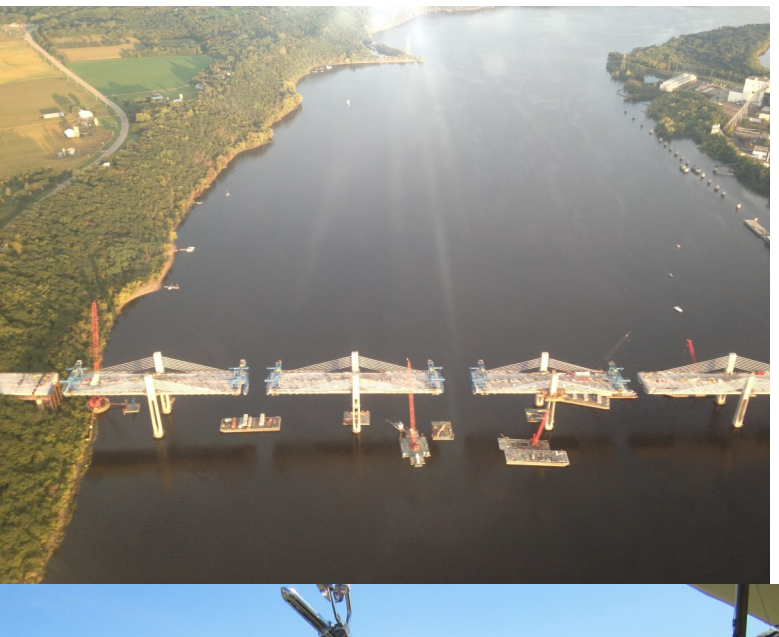
Stillwater Bridge nearing Completion