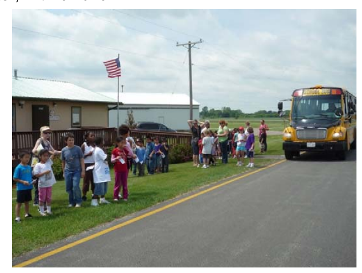
The Bus arrives with our guests

This past summer a few chapter members opened up their hangars for the kids of the Farnsworth Aerospace School. Below is a few pictures from the event that were pulled from our website. This program was set up from our Education Director, Art Edhlund.