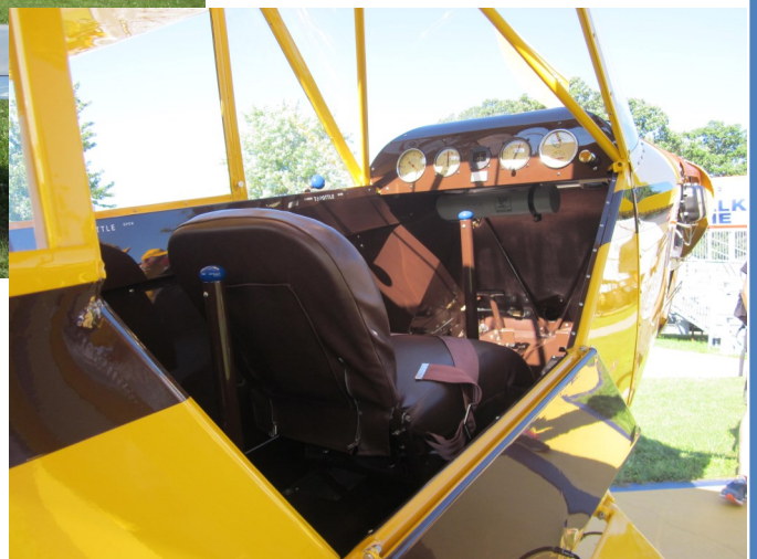
A Restored CUB at the Vintage Area.