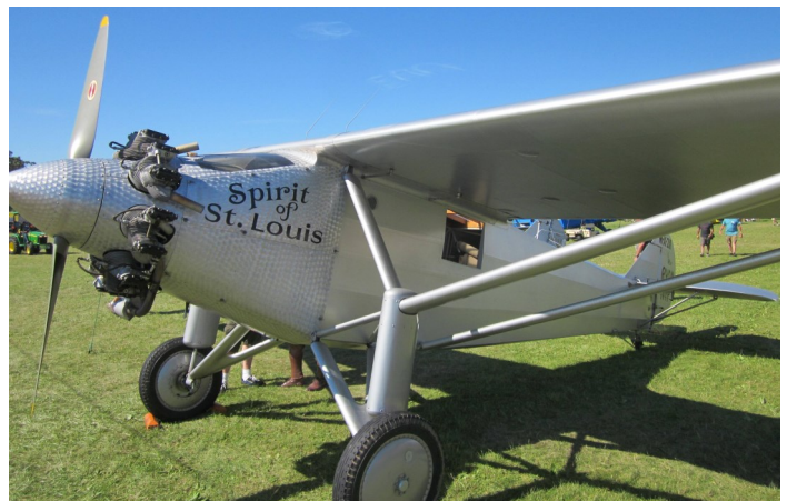
EAA CHAPTER 54 THE BEACON