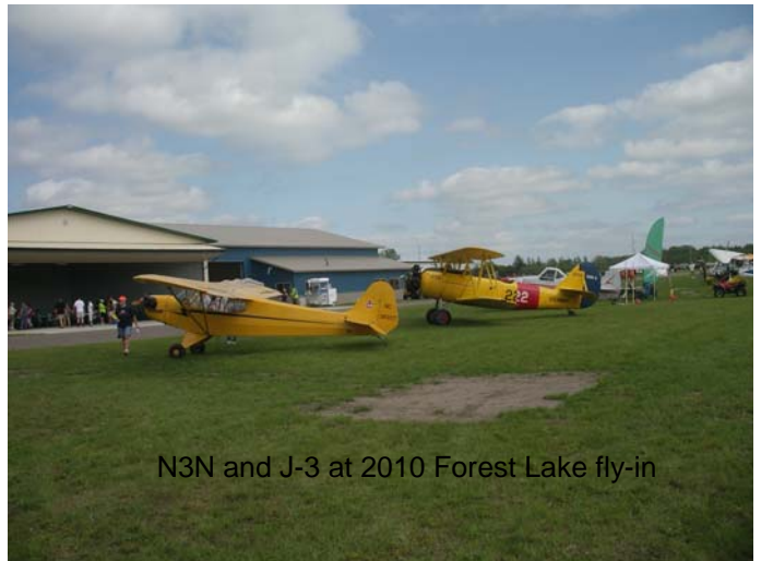
N3N and J-3 at 2010 Forest Lake fly-in