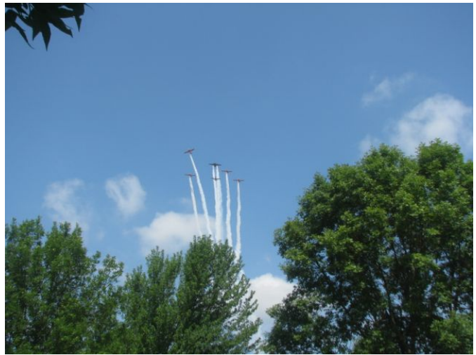
Missing Man formation flown over the Memorial Wall Event

Sorry for the delay in this month's newsletter as I am barely organized from returning from Oshkosh. AA sent me to Chicago on Tuesday after I got back from OSH, to train for Deicing our aircraft during the winter season. It is just plain -ole scary that we are thinking of cold weather and snow already!