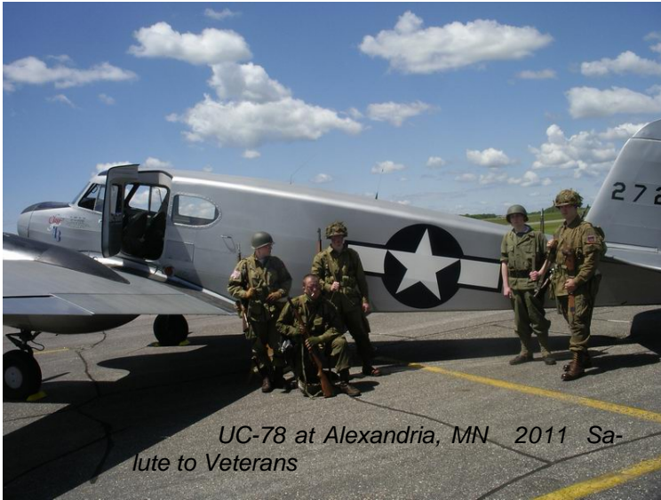
UC-78 at Alexandria, MN 2011 Salute to Veterans

The EAFB's primary activity is a social gathering each Saturday morning to enjoy a hangar-made breakfast, talk with the veterans and other old-timers, and plan the maintenance and flying tasks for the day. Most recently they have undertaken a concerted effort to bring these historic aircraft to local fly-ins to let wider audiences appreciate them. At every show there someone will walk up and start a conversation with "I flew one of those back in the war" or "My father trained in that type before he flew B-17s ". The opportunity to hear their stories is priceless.