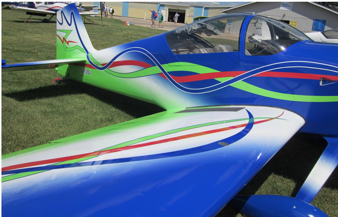
Beautiful, unique paint job on an RV 7 at Airventure 2016

Look for an email from me soon asking for your cold weather flying tips and stories for January's meeting. Please start thinking about any tips or stories you would like to share about your cold weather experiences in the past or currently in the making!