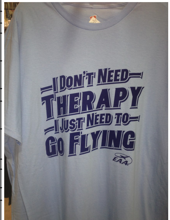
Ground school itinerary to the left. Above: neat t-shirt from the EAA Wearhouse and below a Hamilton from Airventure 2016