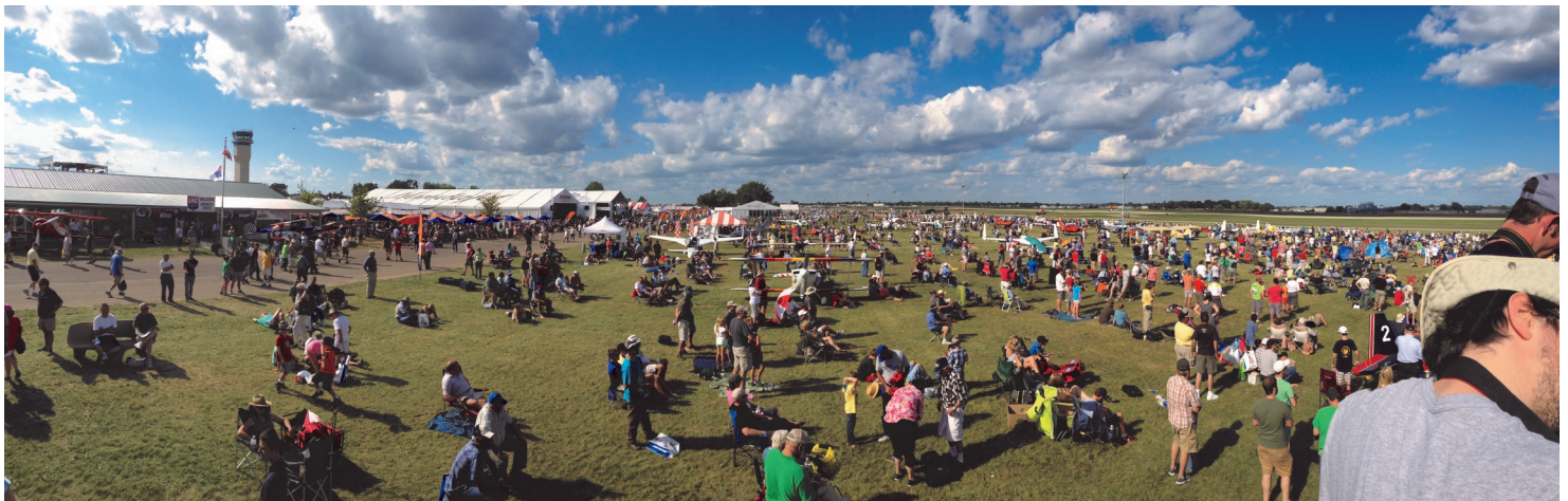
Below is the flight line during an aerobatic airshow at OshKosh 2013