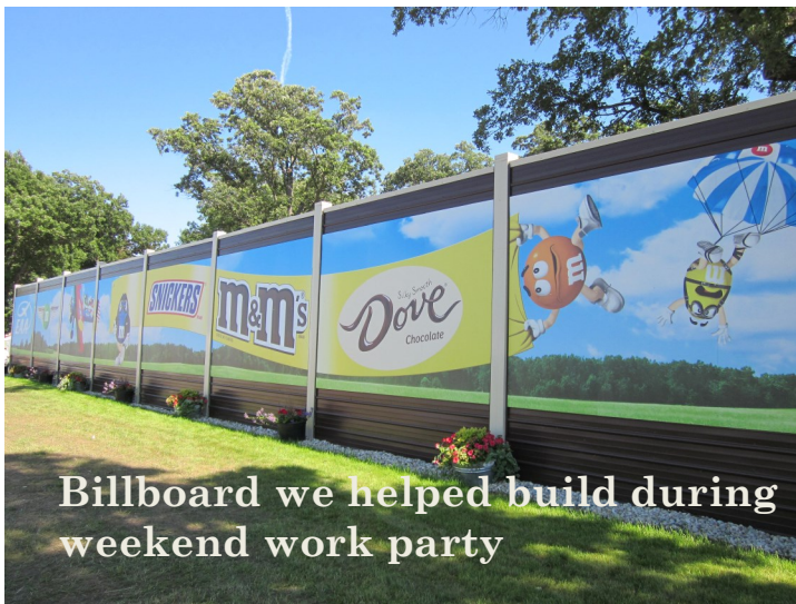
Billboard we helped build during weekend work party