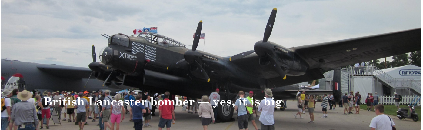
British Lancaster bomber — yes, it is big