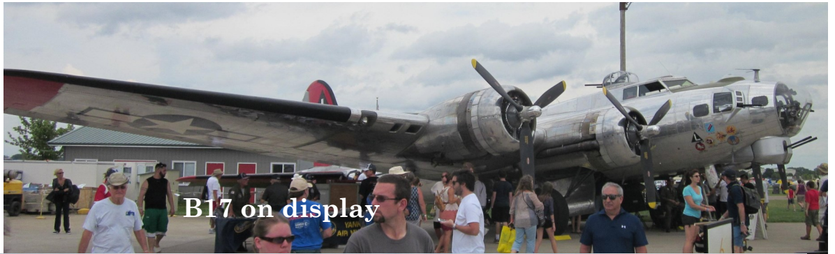
B17 on display