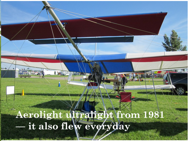
Aerolight ultralight from 1981 — it also flew everyday