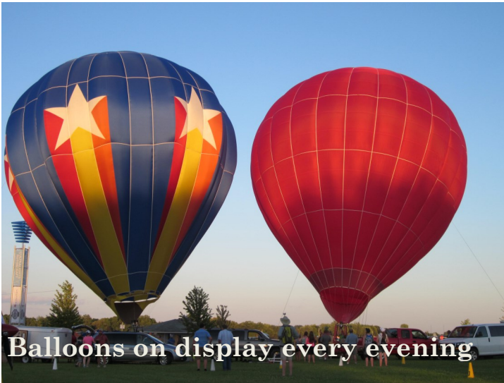
Balloons on display every evening