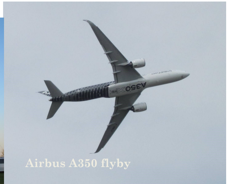
Airbus A350 flyby