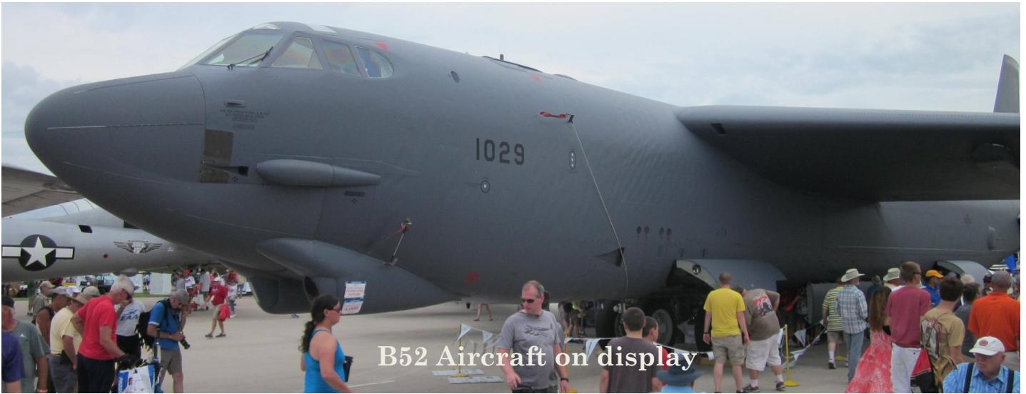
B52 Aircraft on display