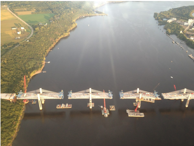
Stillwater Bridge nearing Completion