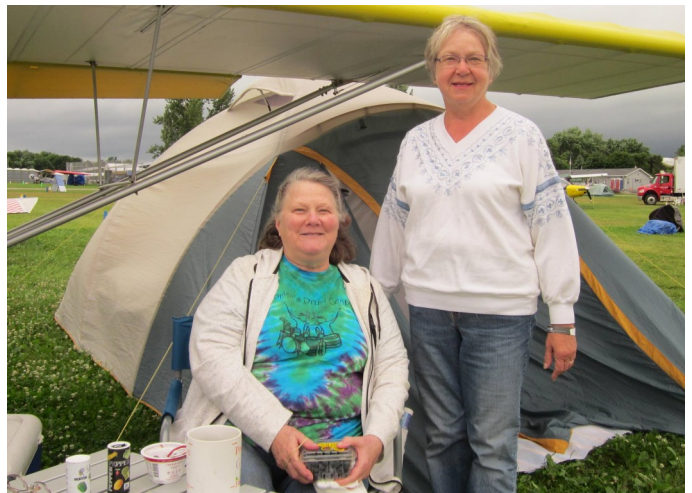
EAA CHAPTER 54 THE BEACON