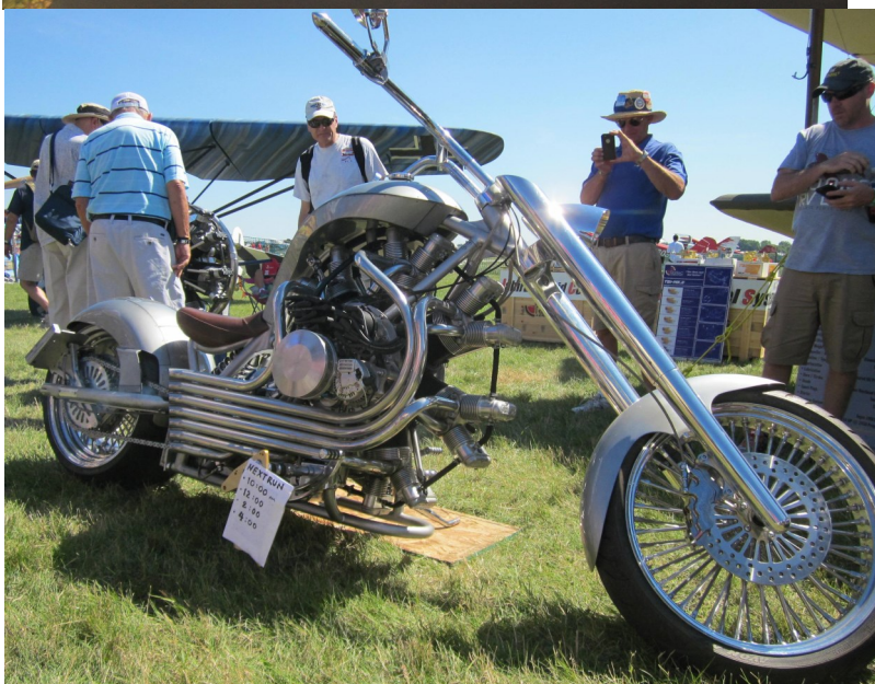
Motorcycle at Airventure with a radial engine

Below, balloons departing from the Ultralight LSA runway due to a rare North East wind that would take them away from the airport.