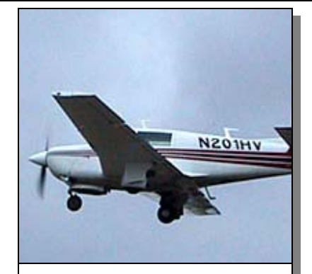
Just a Mooney in the pattern. I have no idea who this is, although it's registered to Cloud Flyers Inc., of Woodbury