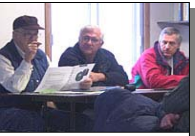
The board discusses the EAA raffle at its February meeting