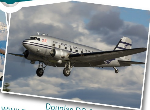
Douglas DC-3 WWII Troop Transport and Early Airliner $295