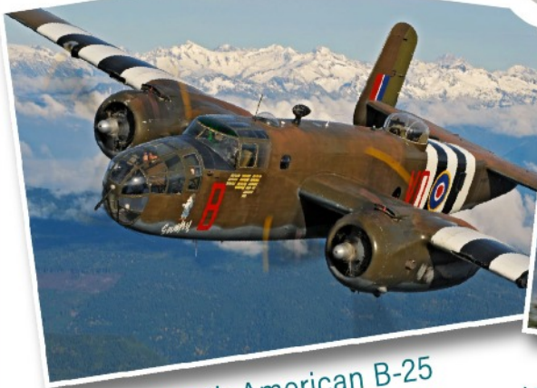
North American B-25 WWII Medium Bomber $425