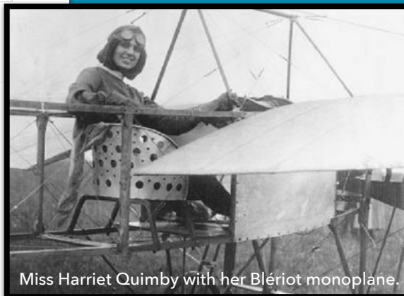
Miss Harriet Quimby with her Blériot monoplane.