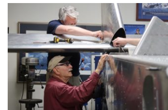
Zenith 750 Cruiser - Veteran's Build