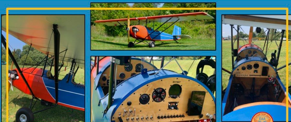
Pietenpol Air Camper - Steve Gross