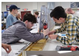
Van's RV12iS Build

Project work days: Thursdays and Saturdays 9:00 - 3:00