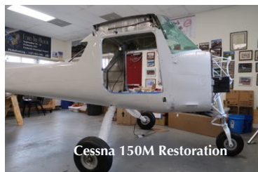
Cessna 150M Restoration