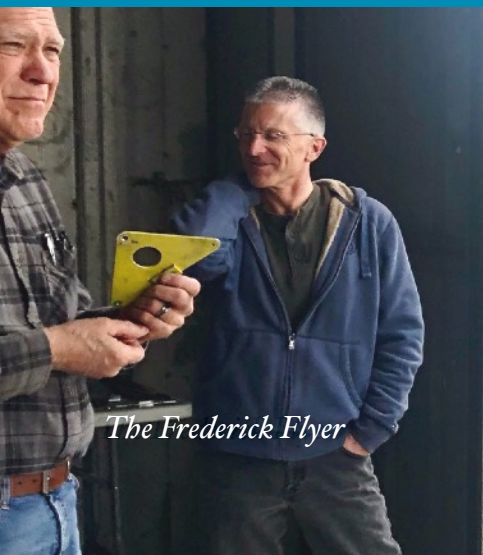
The Frederick Flyer

You can find us on Facebook at: www.facebook.com/EA524