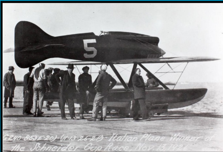
(240-8535-20) (11-13-26 2D) - Italian Plane Winner of the Schneider Cup Race, Nov. 13, 1926

13 November 1926: The 1926 race for the Coupe d’Aviation Maritime Jacques Schneider (the Schneider Trophy) was held at Hampton Roads, a large natural harbor between southeastern Virginia and northeastern North Carolina, two states on the Atlantic coast of the United States. There were an estimated 30,000 spectators. The race consisted of seven laps of a 50 kilometer (31 miles) triangular course.