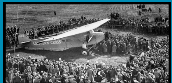
An estimated 25,000 people were waiting at Eagle Farm for Southern Cross’ arrival.