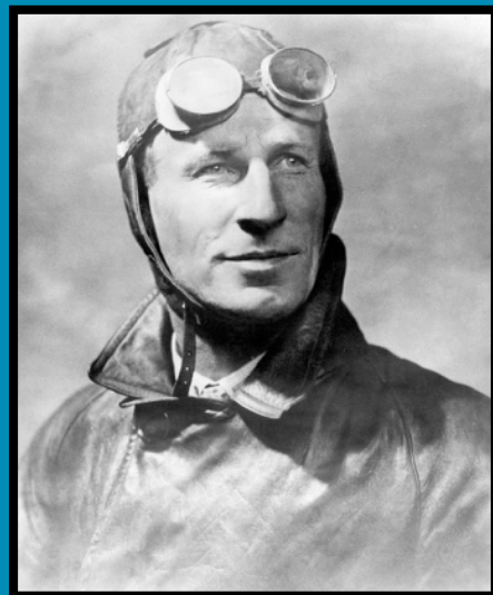
Sir Charles Edward Kingsford Smith, M.C., A.F.C.

(National Archives of Australia, A1200, L93634)