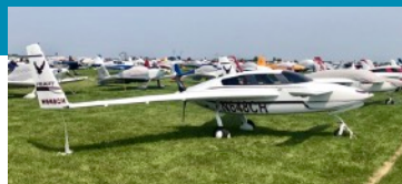
AirVenture 2021 from Tom Comeau