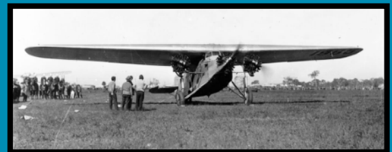
The very thick wing of the Fokker F.VIIb/3m can be seen in this photograph of Southern Cross.