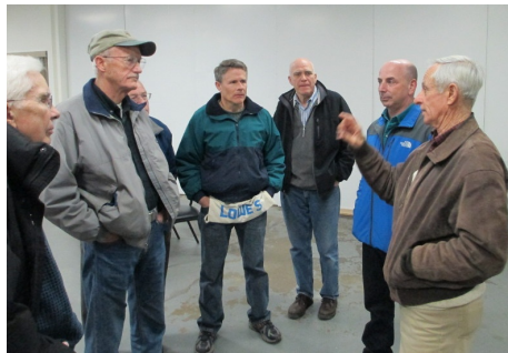
Dean describing what a compressor stall in an F-16 feels like.