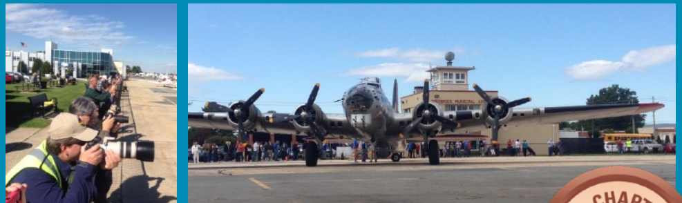
Blast from the past . . . 2014 . . . capturing moments that last a lifetime!