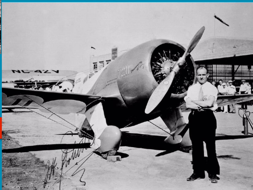
James H. Doolittle with his Gee Bee R-1, NR2100, at the Cleveland National Air Races, 1932.

3 September 1932: At the Cleveland National Air Races, James H. ("Jimmy") Doolittle won the Thompson Trophy Race with his Granville Brothers Aircraft Company Gee Bee Supersportster R-1, NR2100.