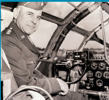
(Original Caption) 6/14/1945-Seattle, WA- Lt. General, James H. Doolittle, after making his first flight in the Boeing B-29 Superfortress, during a brief visit here said, "It's a fine airplane and handles nicely."

CLEVELAND, SEPT. 3. (AP).—Major James H. Doolittle today shattered the world land plane speed record by averaging 296.287 miles an hour over a three-kilometer course at the National Air races.