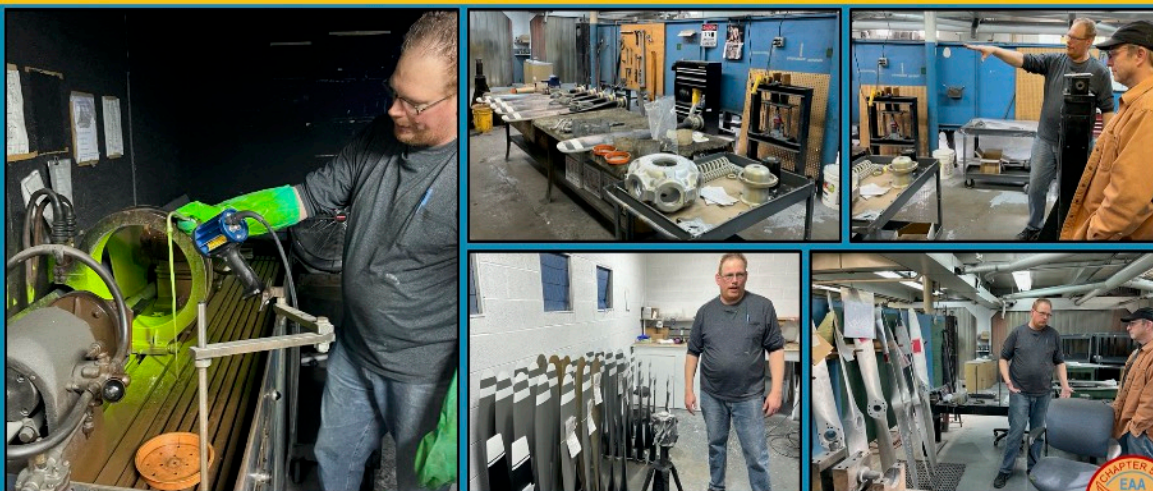
2023 Prop Shop Visit - Lancaster, Pennsylvania