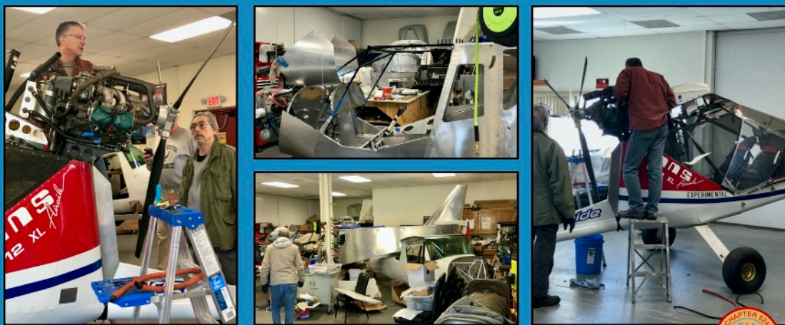
2024 Jan 13 ; Four Planes - One Hangar!