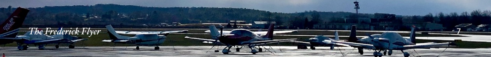
The Frederick Flyer

You can find us on Facebook at: www.facebook.com/EAA524