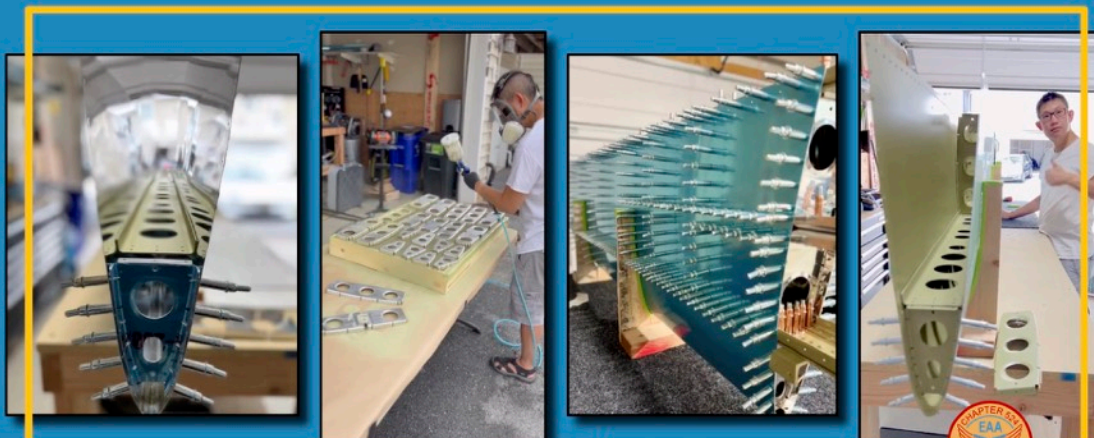
acurim_rv10 - 13 October 2024