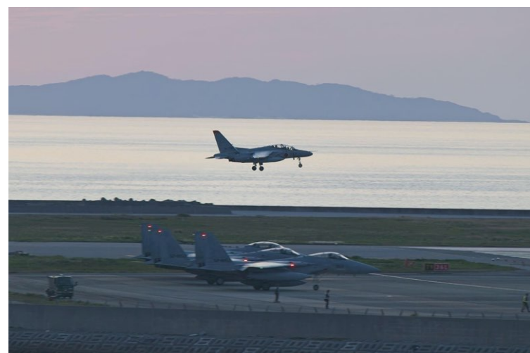
Photo 4: It was difficult to choose a photo from Okinawa since it was the best planespotting I have ever experienced. Last night, we watched the sunset over the turquoise water where there was an Alpha jet landing and 3 Japanese F-15s waiting for takeoff - so many planes at once was incredibly exciting!