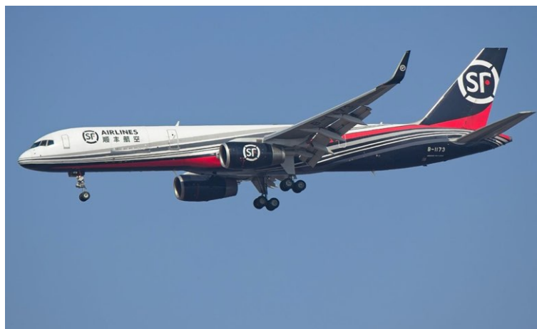
Photo 3: This is a B 757 cargo plane at Incheon Airport near Seoul. We spent a few days near the airport, and I wandered around the area taking photos.