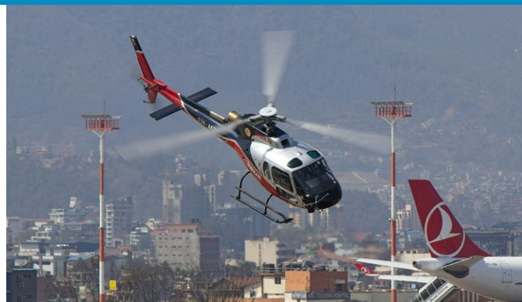
Photo 1: This is an Airbus Helicopter H125 / Eurocopter AS350 B3 I saw in Kathmandu. I rented a small room in a guesthouse near the airport for a few dollars and used their rooftop for 2 days to take photos.