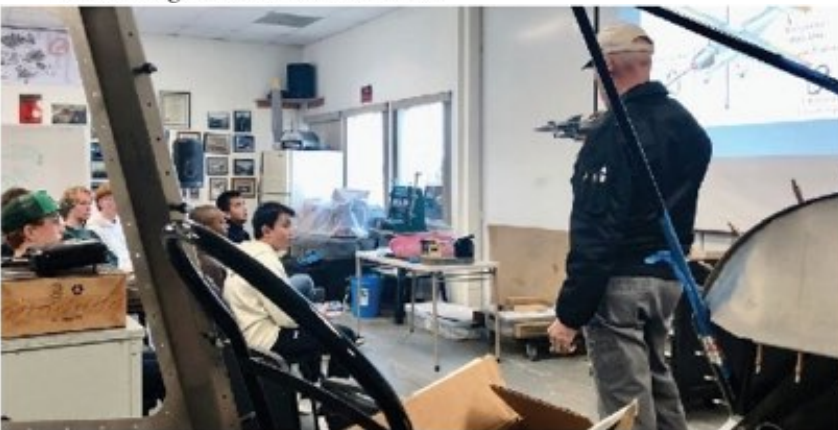
The Frederick Flyer