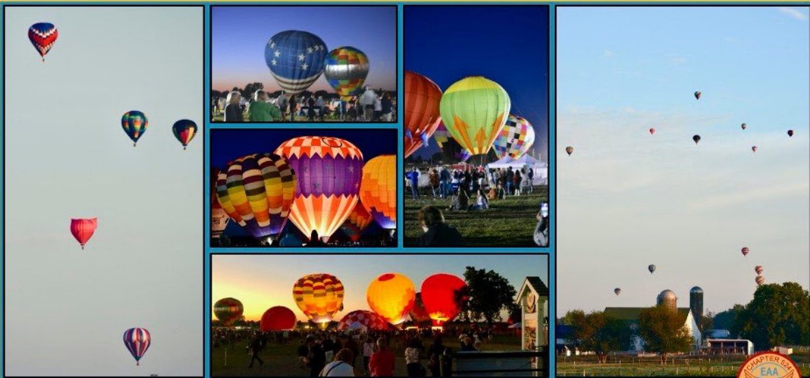
2023 Lancaster Hot Air Balloon Festival