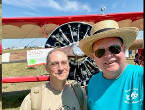
The Frederick Flyer