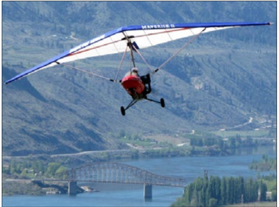
This is a Tryke