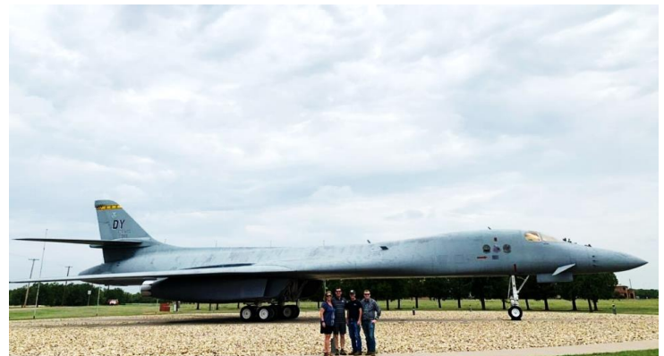
a. Dyess AFB B1B static display; Dyess is home to the B1B and C-130J