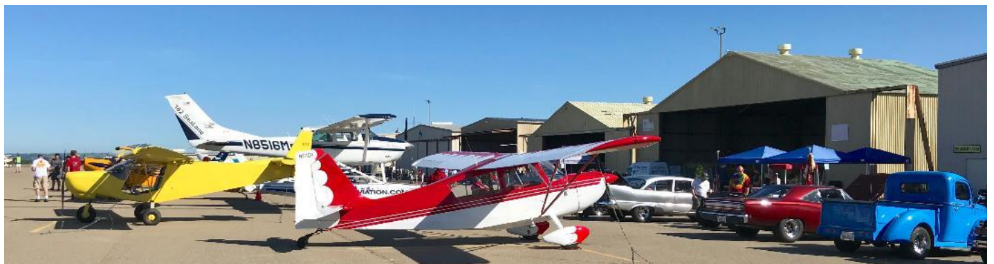
Calaveras Airport from the ground.