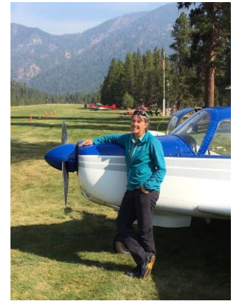
Johnson Creek, ID

friend shared this recipe with me and then I tweaked it. No regulations here! Note: this recipe is just sticky enough it won't explode in the cockpit but doesn't require a napkin. I wrap each one individually for convenience.