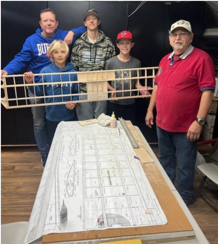
Young Eagles Build & Fly Photos