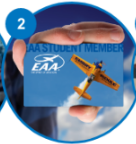
EAA Student Membership