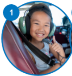
Young Eagles Flight

Please set aside October 26 to come out and share your passion for aviation with the next generation.