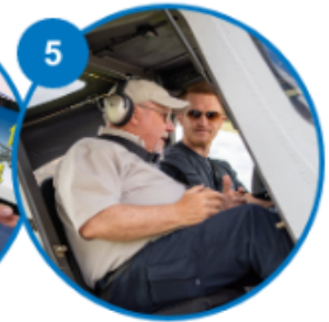
FREE Flight Lesson