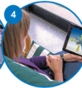
Sporty's Learn to Fly Course