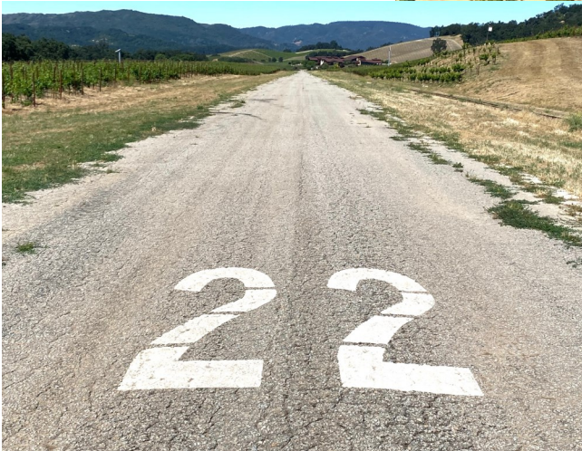
A nice springtime getaway. Wine taste and stay the night then pop over to Paso Robles in the morning and tour the Estrella Warbirds Museum.