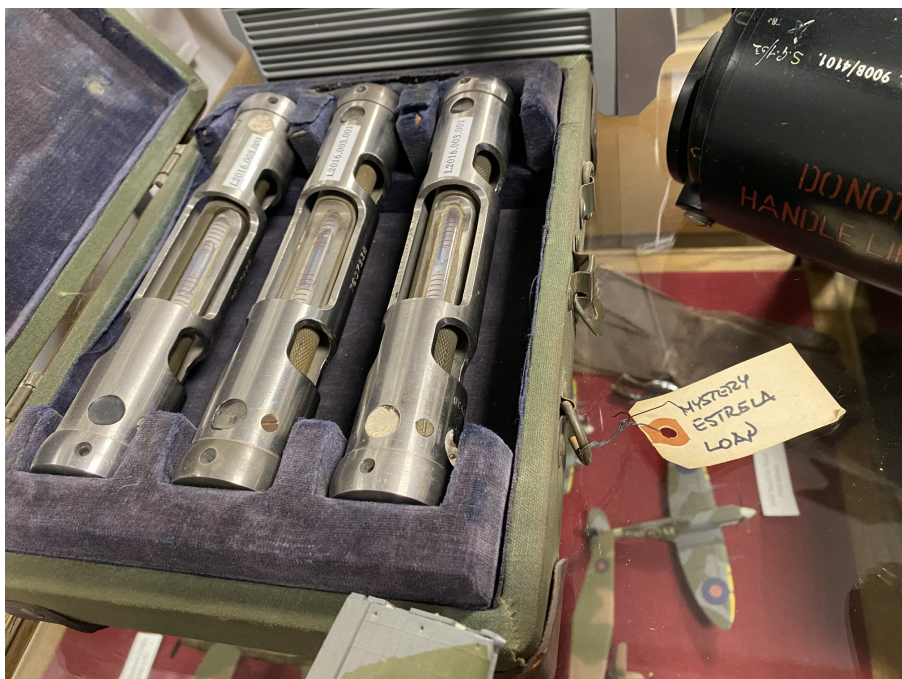
The above mystery items were found at Estrela Warbird Museum. Can you guess what they were used for?

When your wife leaves you alone with the interior decorator and the checkbook.