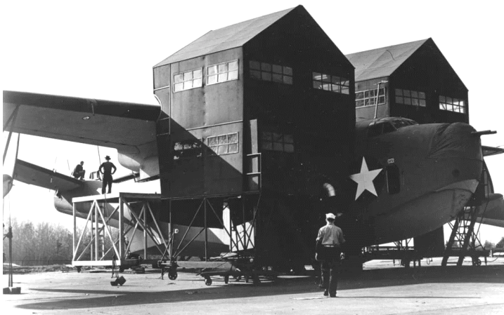
Martin PBM-3D Mariner engine maintenance in cold weather