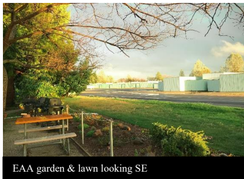
EAA garden & lawn looking SE