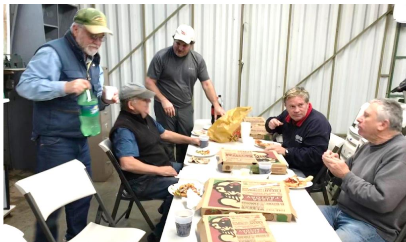
After a hard day's work, everyone shares soda and pizza.