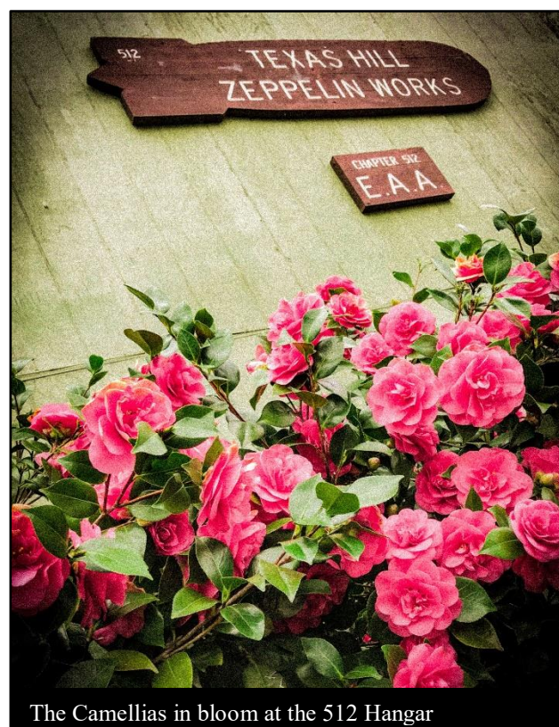
The Camellias in bloom at the 512 Hangar

Dust your engine and change the oil 'cuz the good flying weather is here! And remember: a happy airplane is a happy pilot.