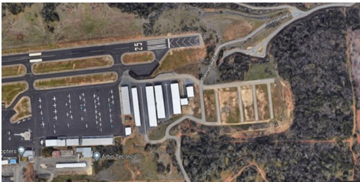
Auburn Airport East End New Development

Several years ago another hangar was finally sold and the contents, a boat and furniture, were removed after more than 10 years.