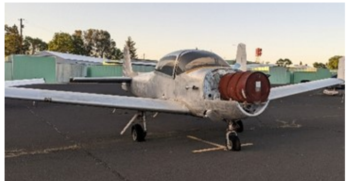
Navion Oil Tanker at Placerville

A lack of enforcement policy by the airport officials is a contributing factor to derelict planes on the ramp or behind hangar doors, damaged hangars and damaged planes, and hangars that sit empty for years.