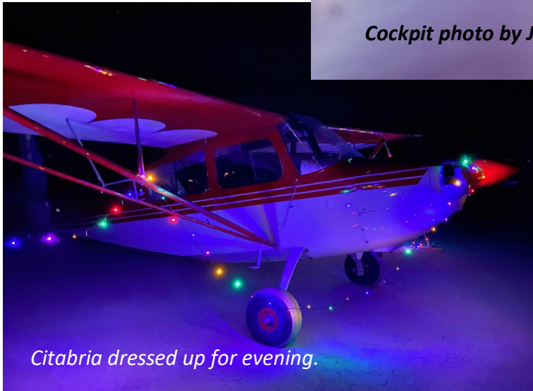
Citabria dressed up for evening.