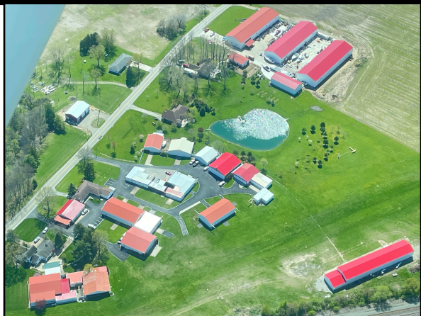
Current Hinde Field : By Tracy Hille