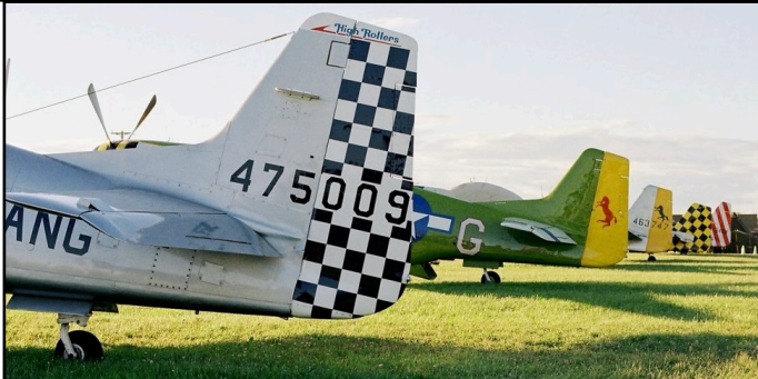
Last four photos from Airventure