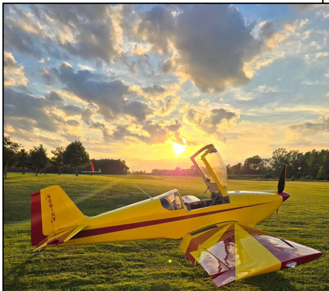
Hinde Field at Dusk: By Deerborn MI. guest