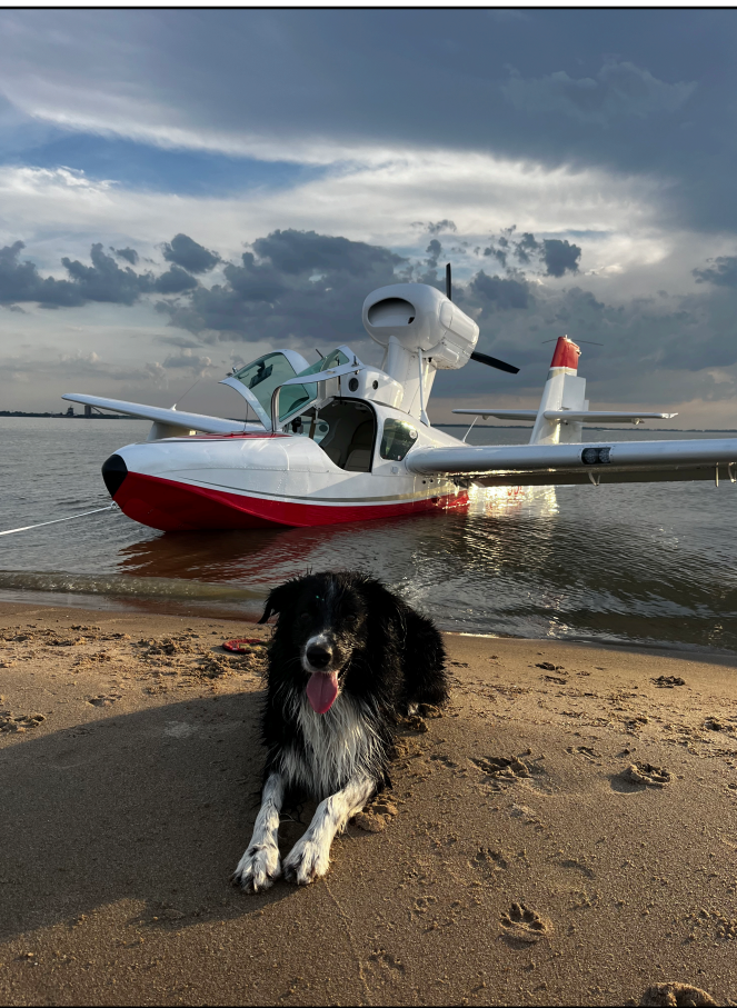
Man's best friends, his plane, his dog, and his Michigan get-a-way