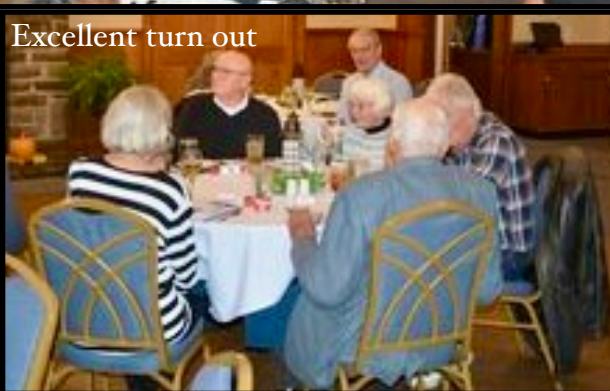
Excellent turn out