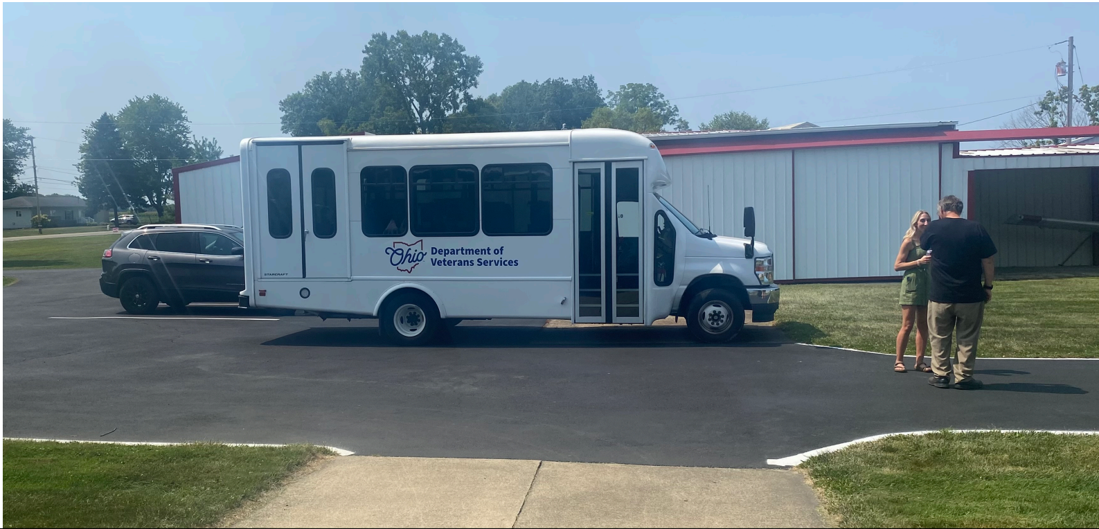
Veteran transportation from the Ohio Veteran's Home to attend the Gleason Memorial Veteran's steak fry