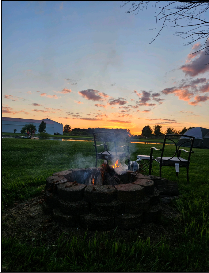
Above and below: Sunset photos