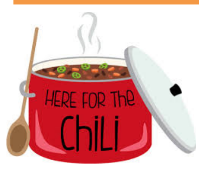
DATE: SEPT. 9th TIME: 12:00 - ? WHERE: MATHER FIELD IOHS SANDUSKY, OH

EAA 50 AND THE GALLOWAY FAMILY PRESENTS THE CHILI FLY IN