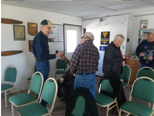
Great meeting! Attending people had to learn a lot!