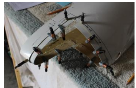
Forming a mounting lip