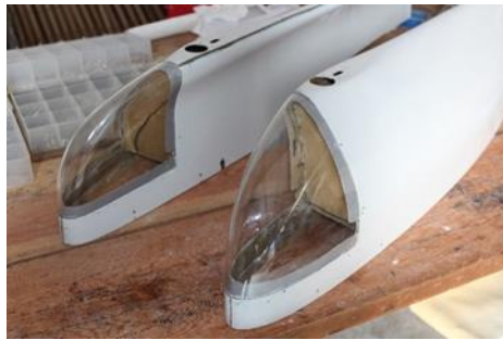
Ready to install lights