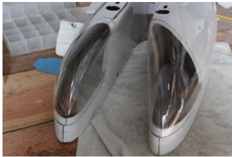
Lenses cut to fit