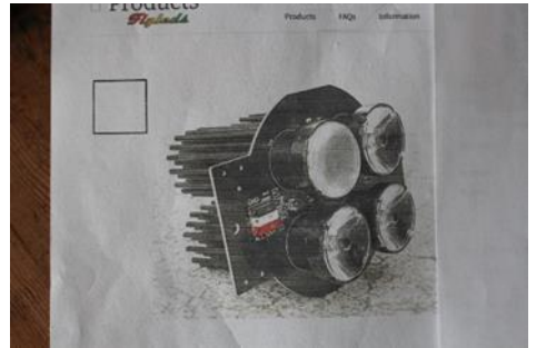
Future Quad light

The last job for the month was to install the GRT Safe-Fly GPS receiver for the EFIS. I could not get my cheaper GPS ideas to work so bought the one made for the EFIS. The plan for next month is paint. Number 1 is a 1912 Blackburn monoplane.