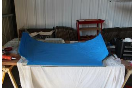
Prepping the window