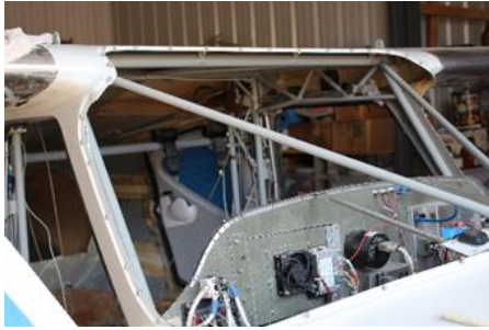
Prepping the fuselage