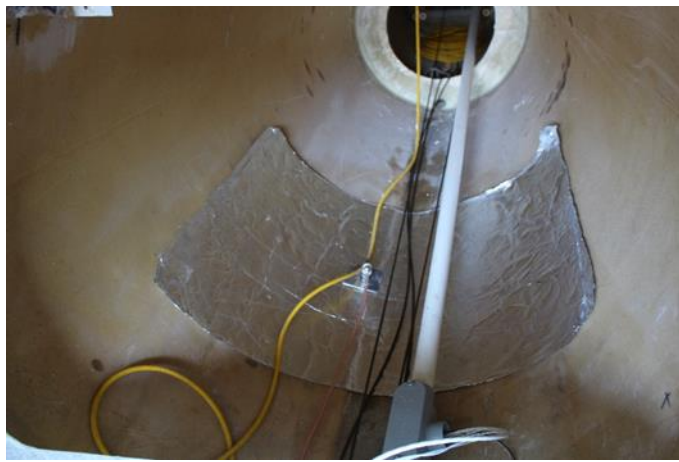
Antennae and foil ground plane