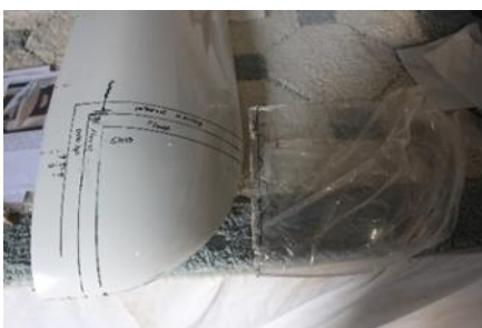
Laying out the cut lines

After Dan Sprague's talk on Non Towered airport use/safety at the last Chapter 495 meeting, I decided to re-think putting landing lights in the wing tips. My main stumbling block was getting clear lenses for the wing tips. I dug back into the on-line builder stories looking for how others had done it and found a recent (a week old) story showing a mold combining the left and right wingtips and the resulting plexi-glass tub made from the mold. That tub sure looked familiar! I found one that looked just like it in my stuff. Every time I had seen it, I couldn't figure out where a clear, kidney-shaped basin would fit in the airplane. Maybe a rear seat lavatory sink? Turns out it was the wing tip lenses that needed to be divided for left and right sides. It took some extra fabricating to get them mounted, but as you can see, they are in. I plan to install quad LED lights with wig-wag function from FLYLED when the budget allows.