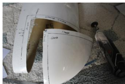
Cutting the hole