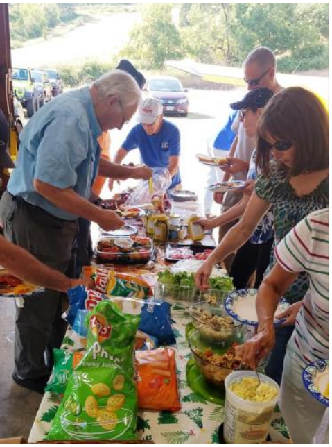
Around the Patch: