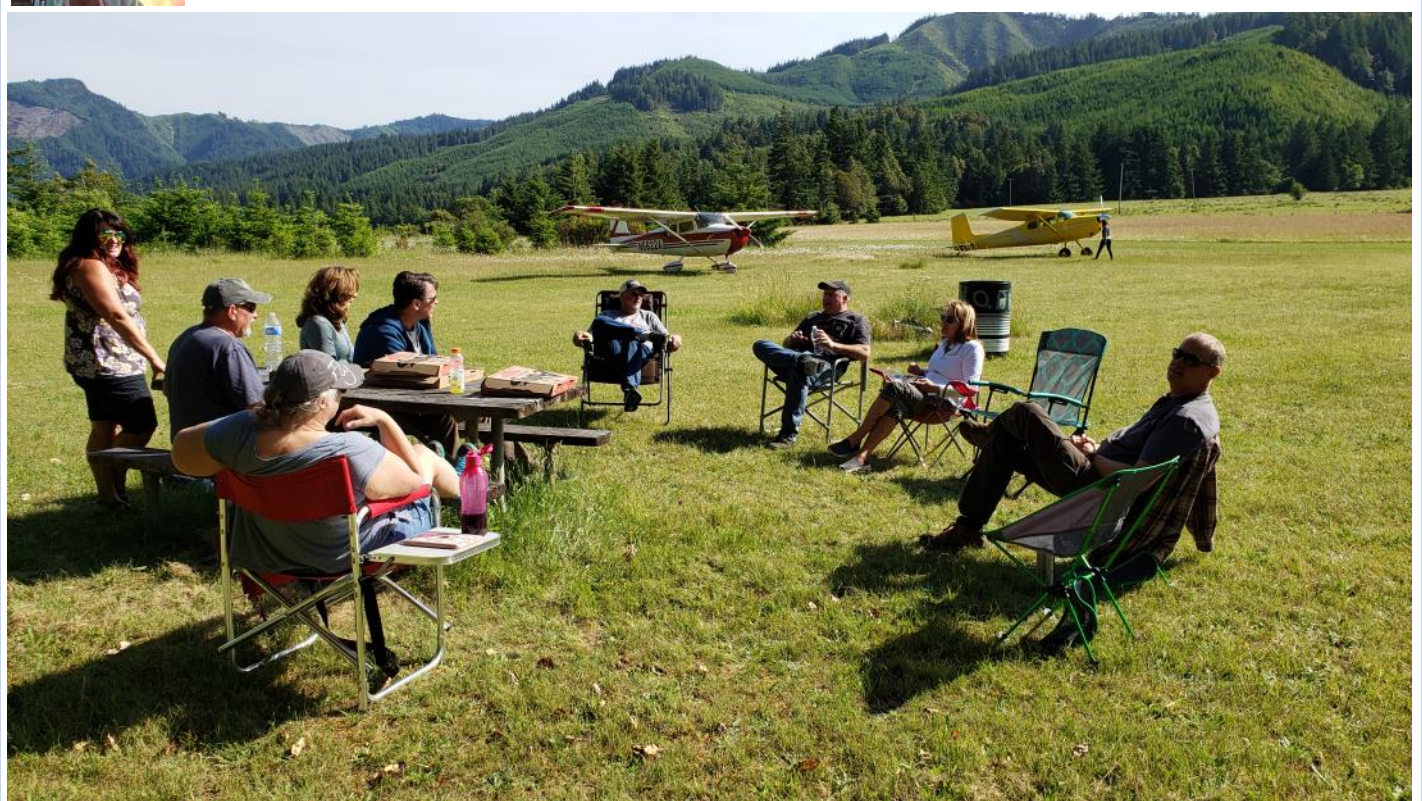
More Powers pictures on the next page.

I did it! I flew to Powers Oregon...winds were about 12+ knots on the way there and 8 knots on the way home. Landed, ate dinner and decided to get home when I looked at the air mattress in the "tiny tent". So I jumped in the plane and made it home just before dark.