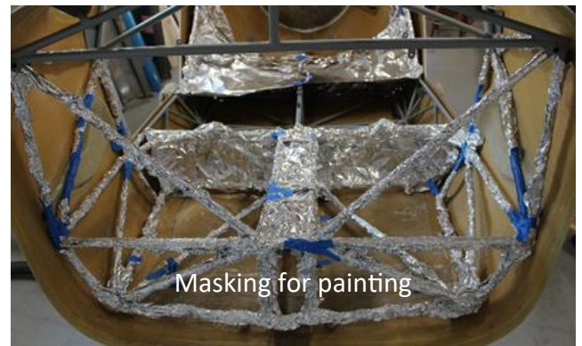
Masking for painting

So, construction has included re-viewing the chapters the other builders did, confirming the work was done and completing a couple of things that were not done. Then I started the Fuselage Systems Installation and actually made progress. I installed the optional cabin air ventilation system, fabricated over 30