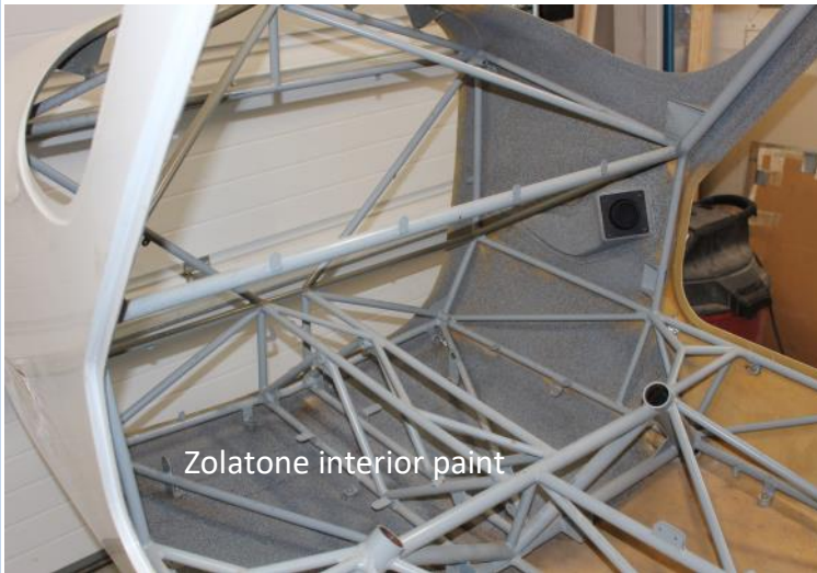
Zolatone interior paint