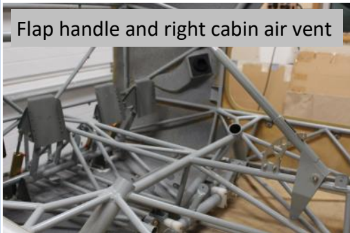
Flap handle and right cabin air vent

she tested positive) and an additional two weeks for us after her 10 days. Fortunately, she was only sick for a couple of days and so far we are good to go but still in