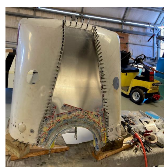
Photo 5 shows the finished lip. The aluminum lower cowling center section has been riveted and external doubters for the cowling attach support have also been riveted. At this point, we are awaiting new support isolators for the cowling. This existing cowling had cracks in the aluminum skin where the cowling attached to the brackets so this is fixed.