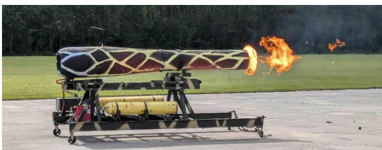
Th_e flying began at noon and ended at 3:45. Just about everything flew except the Airacobra which aborted takeoff for a mechanical issue. During a break in the flying, they demonstrated a V-1 buzz bomb pulse-jet motor, running it on a stand at low power for over a minute until it glowed red.