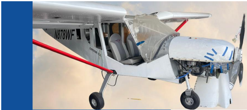
ZENITH 750 CRUZER