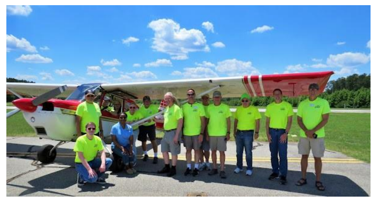
The Team at the Lawrenceville VA Rally