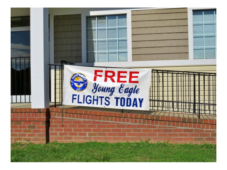
Lawrenceville VA Building Entrance

We have had two great events this month, one in Lawrenceville VA and the second at 2W6. A big thank you to all who participated in these YE Rallys.