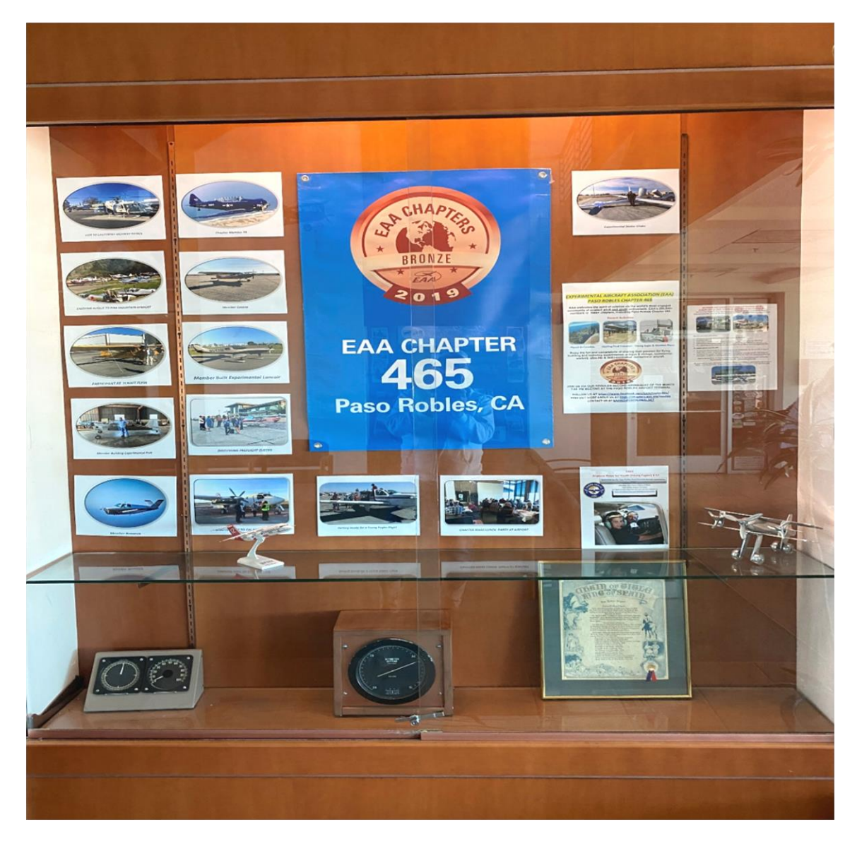
New Chapter promotion display case at Airport – thanks to the Airport Manager Display includes photos of member planes, information on events, etc. If Chapter Members provide us their photos we can add them to the display

The regular 7:00 PM May 13, and related VMC Club, meetings are cancelled due to virus but many of our activities are moving forward <u>https://chapters.eaa.org/eaa465</u>