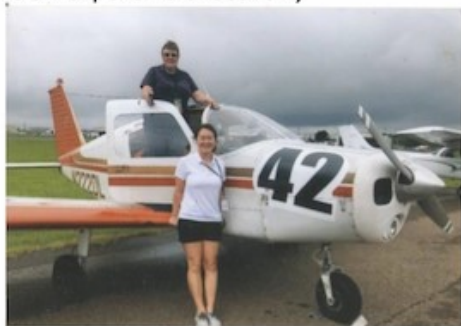
Team 42: The Magpies

The Air Race Classic. Not quite the Bendix Air Races or in the Red Bull League, the Air Race Classic is the epicenter of women's air racing. Pilots range in age from 17 to 90+ years old. The Air Race Classic, Inc. is a nonprofit 501(c)(3) organization dedicated to: Encouraging and Educating current and future women pilots, increasing public awareness of general aviation, demonstrating women's roles in aviation and preserving and promoting the tradition of pioneering women in aviation. The women come from a wide variety of backgrounds including teachers, doctors, nurses, airline pilots, business owners, air traffic controllers and professional pilots. Race Teams, consisting of at least two women pilots, must fly under Visual Flight Rules during daylight hours only and are given four days to make flybys at each en-route timing point and then land at the terminus. The race route changes each year, approximately 2,400 statute miles in length with 8 or 9 timing points. Mary Mattocks (Willy) our illustrious President will regale us with her experiences and adventures having flown 4 air races in her beloved Piper Cherokee and now contemplating her 5 th . (Upon reading this her husband has turned quite pale and taken to his bed as this is quite an expensive endeavor!)