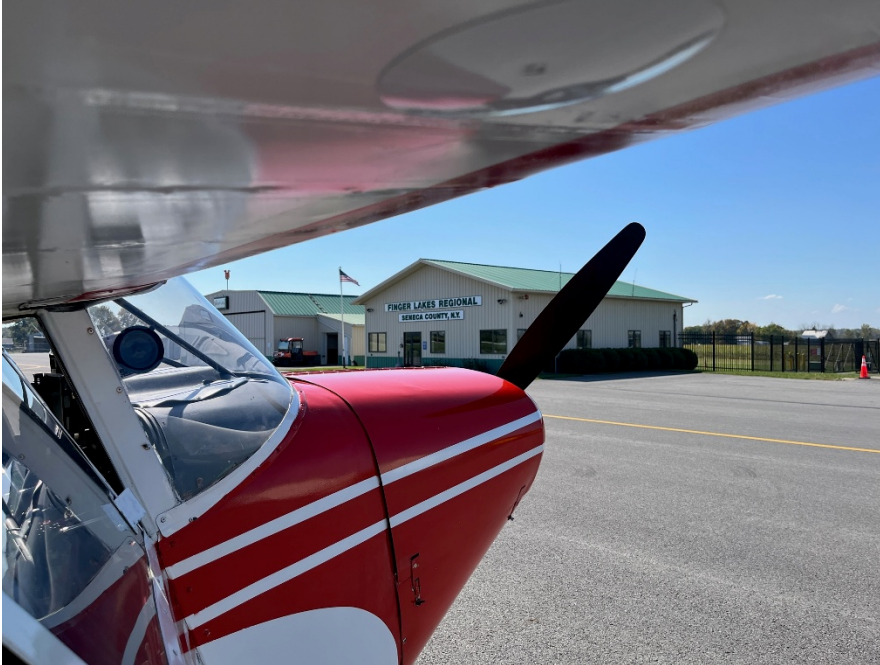
Finger Lakes Regional Airport (0G7)

The other day I made a short cross-country to Finger Lakes Regional airport (0G7, yup Ledgesdale spelled backwards!). The trip was spurred mainly by the fact that the day before, I heard MANY radio calls coming from Finger Lakes and my curiosity said I should go check out why there were so many people flying there. What I discovered was a VERY nice airport. The runway and grounds are spotless, there are plenty of transient tie downs, a well-appointed pilot lounge, self-serve 100LL at a very reasonable price, a courtesy car, and a very friendly and helpful staff. There are at least a couple good places to eat within a few miles, and of course the airborne views of the Finger Lakes are fantastic. If you are looking for a nearby destination for a hamburger or better, I'd definitely recommend it.