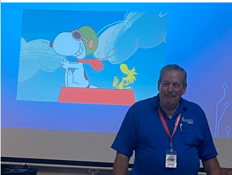
I don't recall what was happening here, but I can't resist an opportunity to show a picture of Snoopy as a WW1 ace. Norm and I share an affection for this cartoon character!