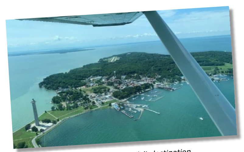
Put-in-Bay, a must visit destination

We took off at 9:30 AM, climbed to 2500 ft, and dodged a few scattered rain showers and towers between Buffalo and Ashtabula, OH. The first stop was Willoughby Lost Nation (KLNN) for gas, munchies and a leg stretch. Twenty minutes later, we were orbiting the area contacting Cleveland Approach for flight following to Put-in-Bay, an Ohio island in Lake Erie. Our request to transition through Class B airspace was granted and the flight along the shoreline past downtown Cleveland was spectacular. After landing we hitched-hiked a ride on a golf cart downtown where we ate lunch at a restaurant overlooking the village marina and bay. Most of the island inhabitants