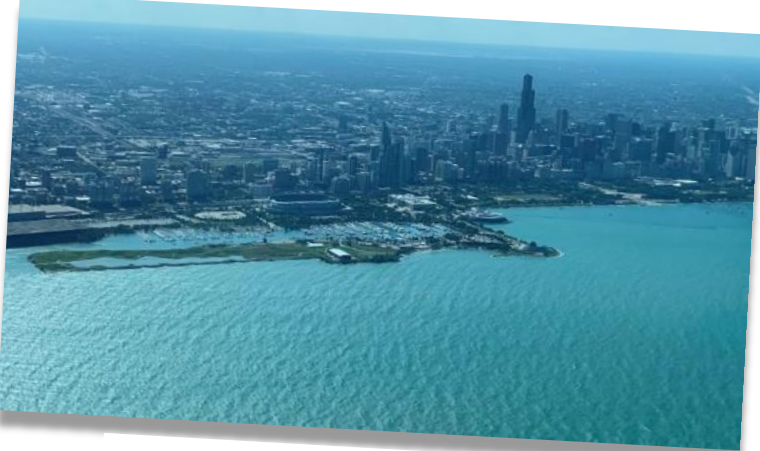
Chicago and what's left of Meigs Field

We were soon back in the air flying along the Chicago skyline listening to O'Hare Approach. I was apprehensive flying the next 55 miles stretch, as the safest engine-out