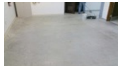
Before above and After below.

We plan to paint Hold Short lines between the shop and Hallway 10-28 and see who gets the joke.