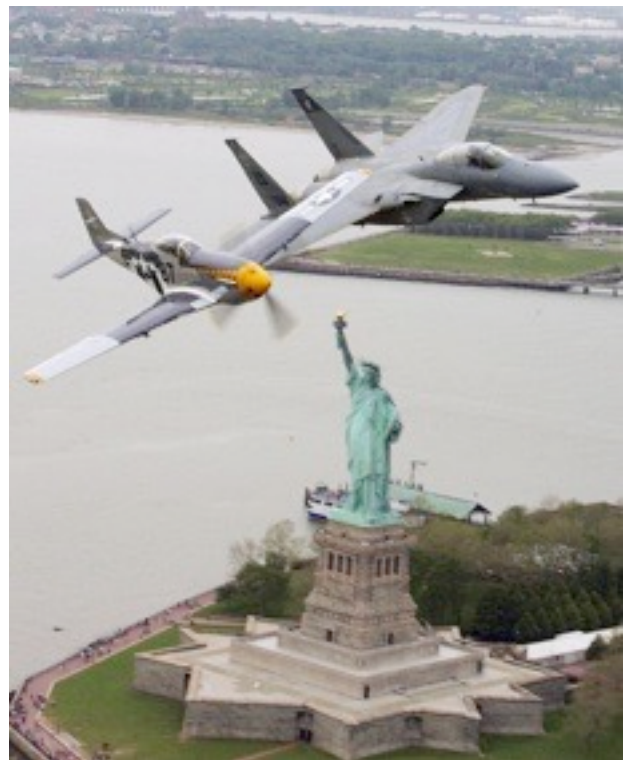
Heritage Flight: P-51 Mustang and F-14 Tomcat at the Statue of Liberty.